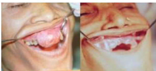
Fig.2: preoperative front view / postoperative follow up