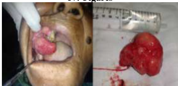
Fig.1: preoperative view / lesion removed in toto